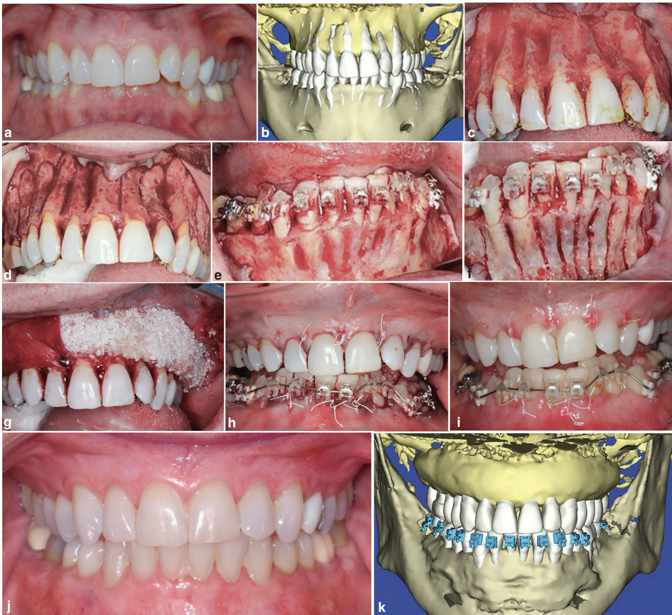
FIGURE 2 Detailed steps of SFOT/PAOO. a) pre-op clinical view; b) pre-op computer analysis of CBCT (note the prevalence of fenestration and dehiscence- dentoalveolar deficiencies); c) surgical view- maxillary view; d) maxilla with corticotomy; e) surgical view-mandibular view; f) mandible with corticotomy; g) bone augmented maxilla with portions covered with collagen barrier membrane; h) closure with ePTFE sutures; i) 1 wk. post-op; j) case completion; and k) post-op computer analysis of CBCT.

augmentation or can be addressed as a preliminary preparatory surgical procedure. In this latter situation, an additional 3 months of healing is required. In Fig. 1 , the panel jointly developed a decision tree for SFOT with or without soft tissue augmentation. Additionally, the panelists compared and contrasted their various approaches to SFOT.